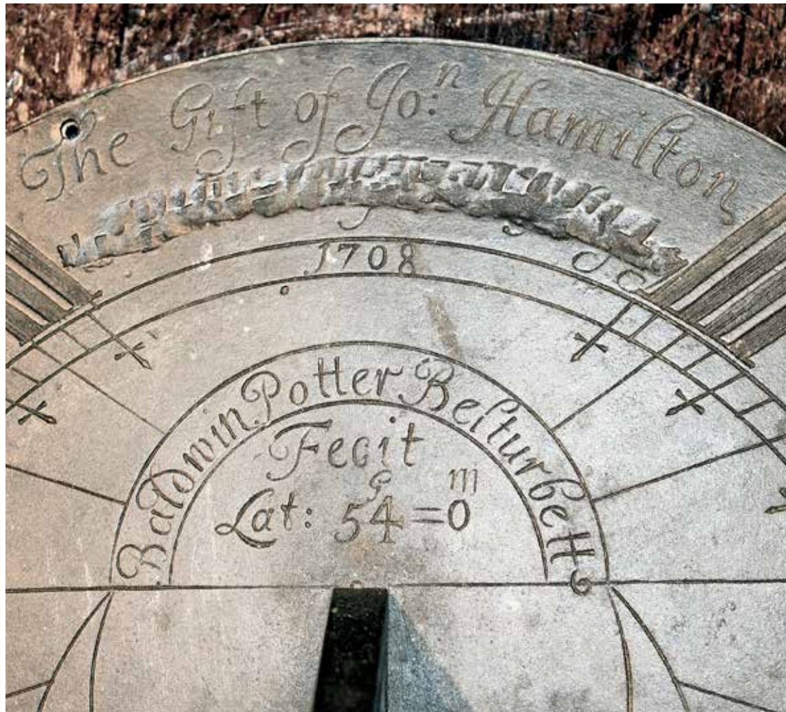
Figure 7. Detail of the sundial signature, which also shows the erased inscription we will never know the meaning of.

town clock till 1731, when the job was carried on by William till 1742 or even later. It is thought Baldwin died about 1733. He would have been about 73 years old.